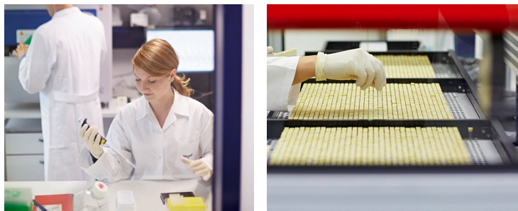
The MorphoSys implementation of Genedata Biologics® as their end-to-end workflow platform has resulted in a significant increase of efficiency across all R&D functions, including library generation, screening and selection, molecular biology, antibody screening, protein engineering, expression, purification, and analytics.

To cope with this data avalanche, MorphoSys decided to implement a corporate workflow platform as a “data backbone” to capture and process all data generated by their R&D programs.