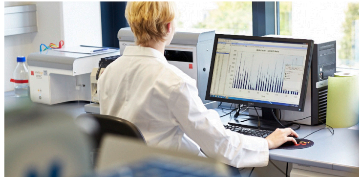
Genedata Biologics® has become MorphoSys' central "mission-control center" for all R&D programs. All R&D teams have immediate access to comprehensive status information on all projects at any time, which allows for effective decision-making at all levels. At MorphoSys, 150 users, including scientists, program managers, engineers, technicians, IT, and management benefit on a daily basis from the shared platform.

make decisions. Using a shared workflow platform also encourages all collaborators to review, comment on, and use the same data and planning information. This improves accuracy and quality of critical project data, and effectively cuts down on redundancies and inconsistencies.