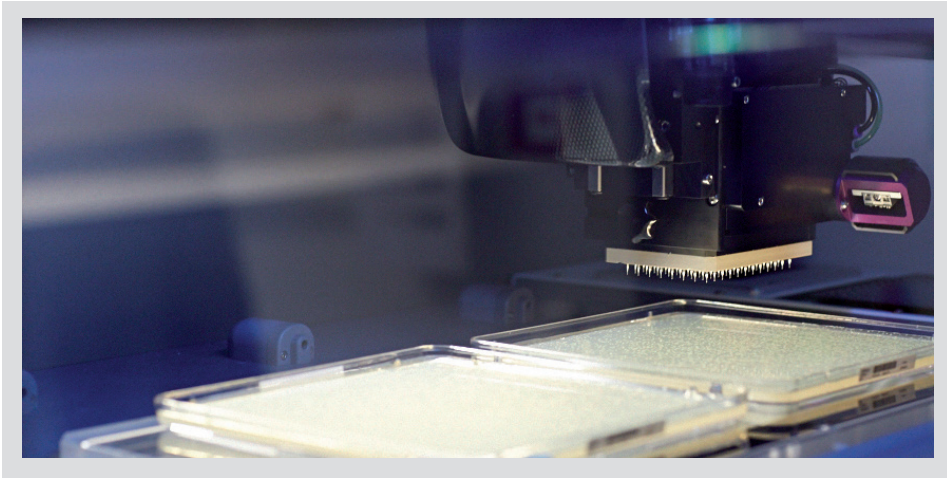
Morphosys has integrated their high-throughput robotic platforms to directly interact with Genedata Biologics®. This enables full automation of the overall process for antibody library screening, including isolate tracking, from automated picking of bacterial colonies, primary screening of thousands of single clones in robust 96/384 well assays (ELISA, FACS, Biacore, etc.), fully automated transfer of a pre-defined selection of positive clones for further validation, cross-assay hit selection, including cross-reactivity and quality control of positive clones, and automating the iterative affinity maturation processes. Open interfaces enable a transparent integration via APIs (RESTful webservices).

MorphoSys is now well prepared to address new large-molecule R&D requirements as they benefit from having an evolving system, with multiple