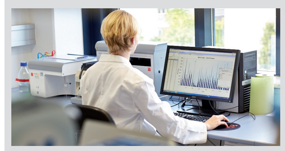
Genedata Biologics® has become MorphoSys' central "mission-control center" for all R&D programs. All R&D teams have immediate access to comprehensive status information on all projects at any time, which allows for effective decision-making at all levels. At MorphoSys, 150 users, including scientists, program managers, engineers, technicians, IT, and management benefit on a daily basis from the shared platform.

This access to R&D information has transformed how MorphoSys operates today. In dedicated project dashboards, all teams can look up project information such as molecule characteristics (e.g., sequences, assay data, analytics data), as well as operational key performance indicators (KPIs) that help them more effectively make decisions. Using a shared workflow platform also encourages all