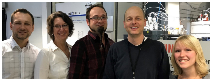
The Analytical Development laboratory at Bayer Pharmaceuticals in Wuppertal

We especially appreciated the high level of expertise and support provided by Genedata, which enabled us to optimize every stage of our MS-based analytical processes—while incorporating industry best practices—and quickly generate high-quality results. Our partnership also gives us the opportunity to address highly specific needs by including customized functionalities in the software. For example, the open architecture of Genedata Expressionist allows us to automatically create highly individualized reports that accelerate and facilitate decision-making by providing at-a-glance interpretation of results. Quickly identifying issues in this way can be invaluable in saving time and resources across the biotherapeutic development process.