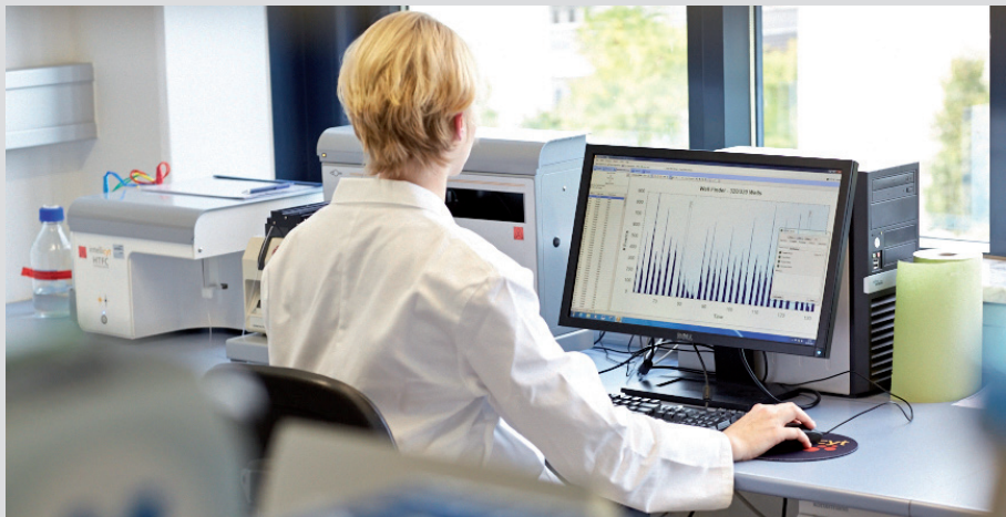
Genedata Biologics® has become MorphoSys' central "mission-control center" for all R&D programs. All R&D teams have immediate access to comprehensive status information on all projects at any time, which allows for effective decision-making at all levels. At MorphoSys, 150 users, including scientists, program managers, engineers, technicians, IT, and management benefit on a daily basis from the shared platform.

This access to R&D information has transformed how MorphoSys operates today. In dedicated project dashboards, all teams can look up project information such as molecule characteristics (e.g., sequences, assay data, analytics data), as well as operational key performance indicators (KPIs) that help them more effectively make decisions. Using a shared workflow platform also encourages all